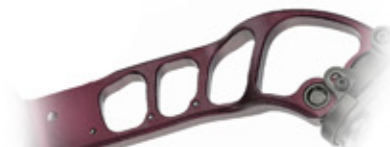
MALBEC RED SATIN