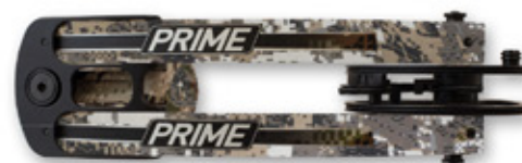
SITKA ELEVATED II