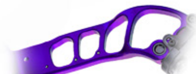
NEW! PURPLE HAZE