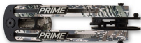
SITKA OPEN COUNTRY